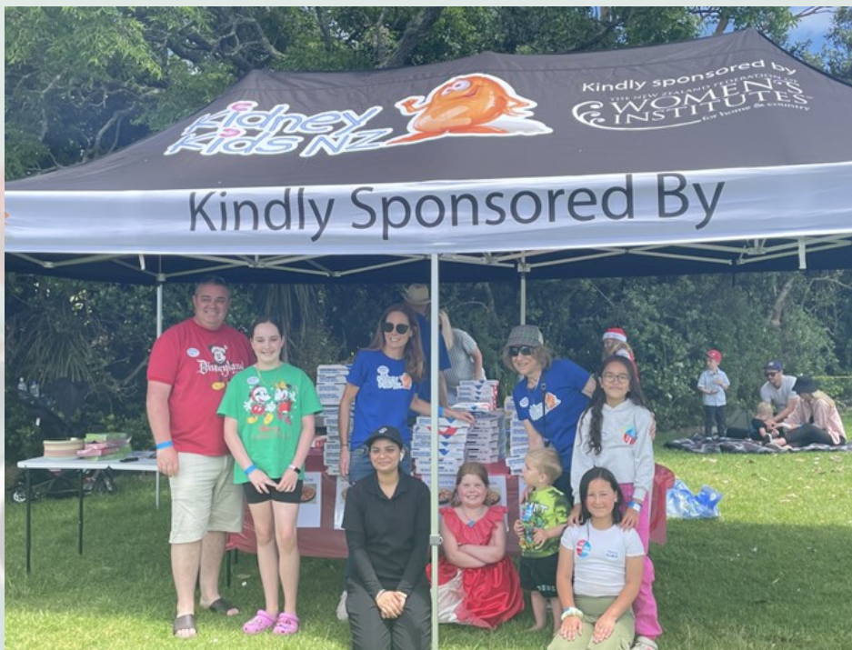
Kidney Kids Team with Dominos serving lunch for our Kidney Kids families.