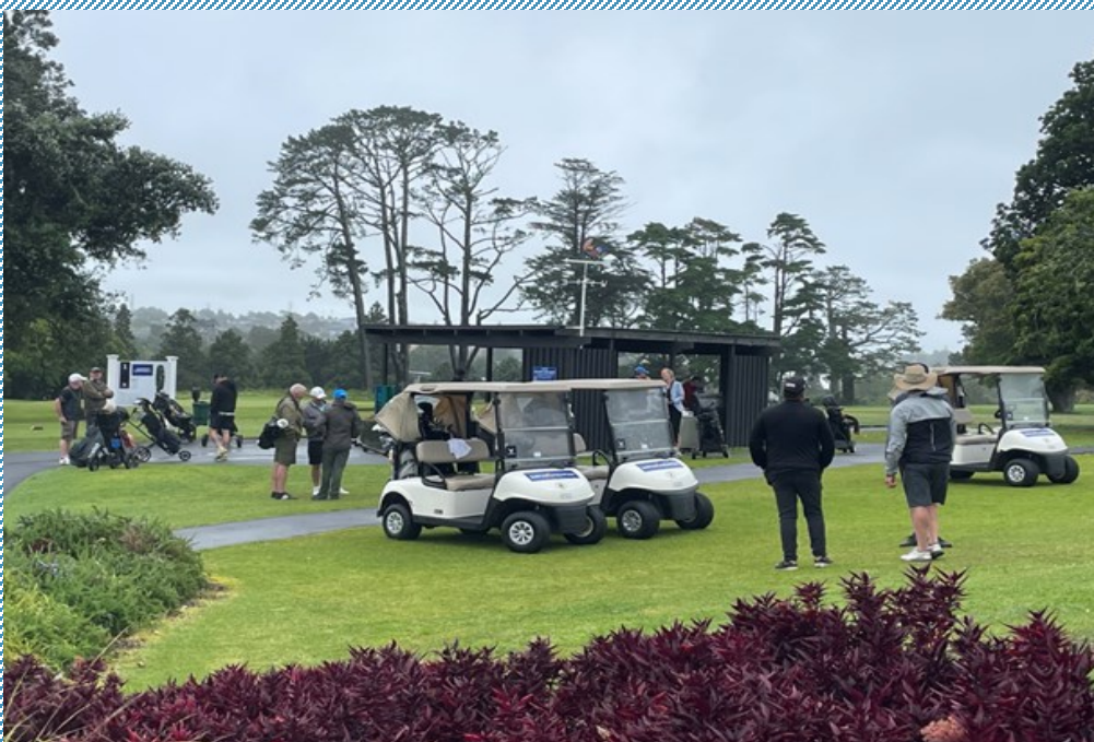
(Akarana Golf Club)